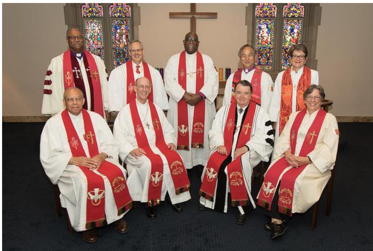
2012-2016 College of Bishops

(The Book of Discipline of The United Methodist Church)