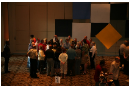
5 Delegation Spot Conversation