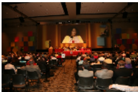
2 On The Floor of Conference