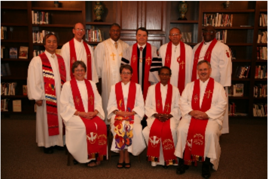
2008-2012 College of Bishops