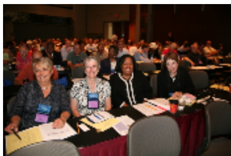
3 Bishops' Spouses During Session