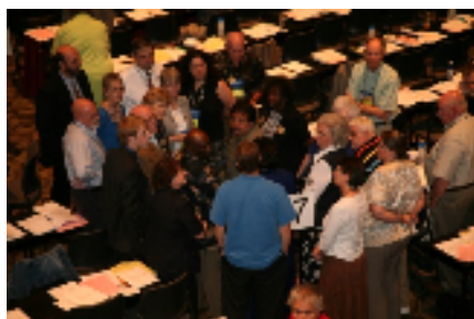
6 Delegation Spot Conversation