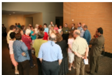
1 Delegation Spot Conversation