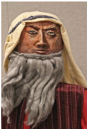
Scripture comes to life